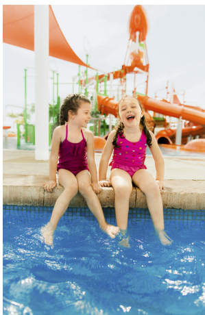
The Aqua Nick water park has daily slime time, and kids rinse off in the pool.

As for the room, a sweet sliding glass door separated the living space from the bedroom, so the evening didn’t have to end when the kids went down for the night. And a loaner step stool in the bathroom made toothbrushing a breeze.